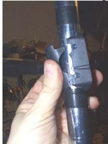
Inside/Outside black clip